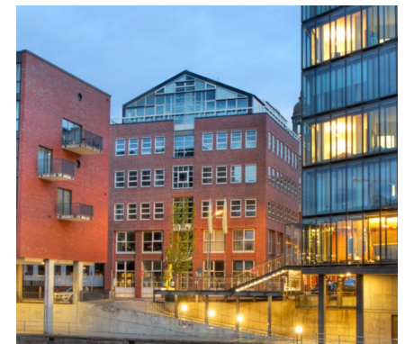
SECO headquarter in Hamburg

Since 1873 SECO has been trading between Japan and Germany. Japan has left its mark on SECO and made us internalize important business virtues: quality management, precision, flexibility and vision. Remaining true to these standards in the development of RuXXac has led to a successful and sustainable business.